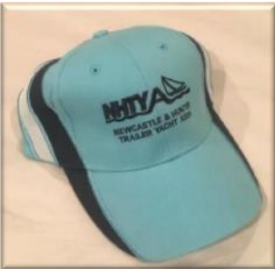
Caps $25 each