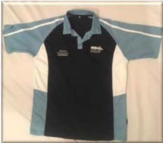
Shirts $25 each