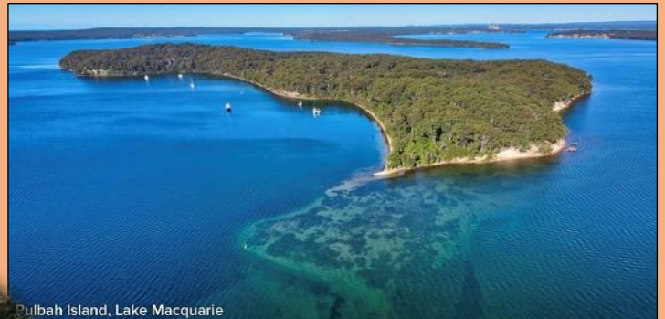
Pulbah Island, Lake Macquarie

Cruising our wonderful lake wherever the wind takes us. Just where will our overnight stop be this time;