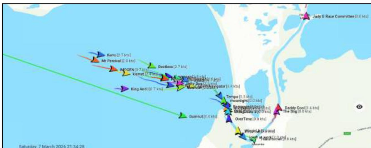
Fig 1 A post-race screenshot of SailPro – 2134hrs on Saturday 07 March, lead boats halfway through the McLennan Strait, back of fleet halfway across Lake Wellington and the Judy G Race Committee vessel, parked at Hollands Landing.

The introduction of SailPro Live Race Tracking that was voluntarily taken up by more than 70 boats provided a great overview of the fleet, particularly for the Race Management Team, purely as a guide to where boats were located. Quality of data captured was generally very good with accurate speeds and locations. Some anomalies with data were evident dependent on phone/tablet settings and location of the device in the boat having reasonable reception of GPS data and transmission of data to the website.