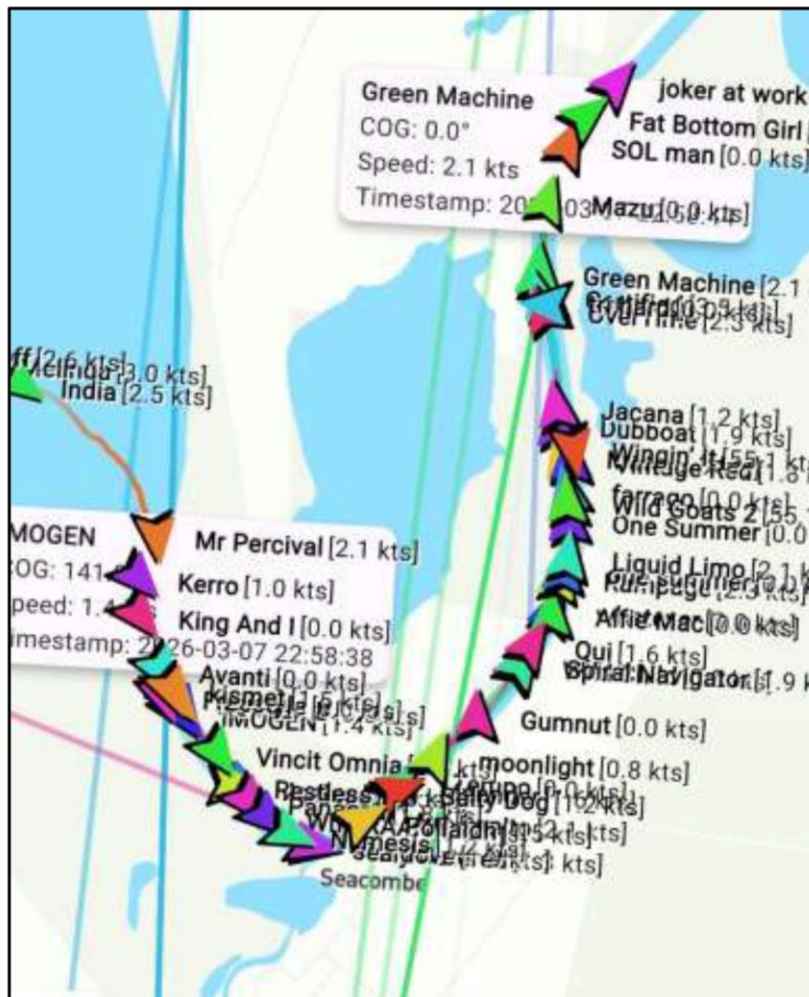
Fig 2: A screenshot taken during the event illustrating the string of boats progressing through McLennan Strait.

The light wind filled in from the north west and kept boats moving providing great sailing conditions compared to the forecast winds. Competitors bragged after the race that they barely had to tack for the whole duration and all boats were finished by about 9:30am on Sunday.