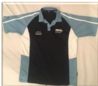
Shirts $25 each