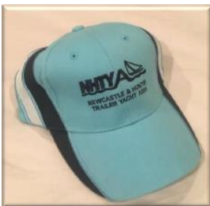
Caps $25 each