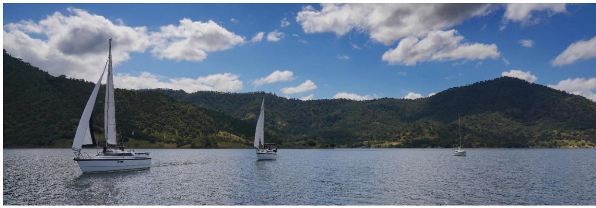
Leaving the ramp