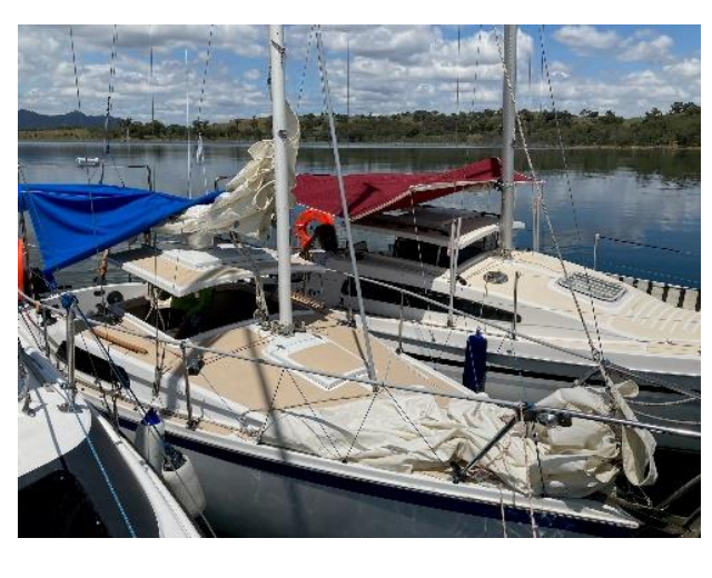
Scallywag and Aquila ramped up for lunch. Both previously owned by Bob and Sybil Potter