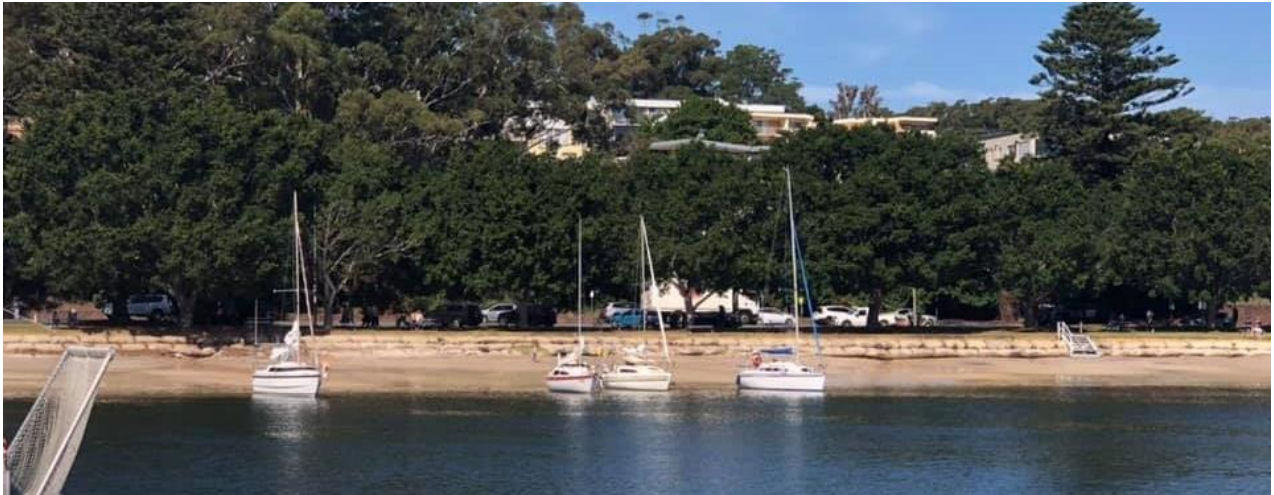
Heaps of room for your boats!!

At the NHTYA registration, skippers will need to complete the registration form, i.e. skipper and crew names, name of boat and sail number, and sign a stat dec stating that you have insurance for your boat, you are part of a club which is registered with Sailing Australia, you have Sail Australia membership, and you have completed a Cat 7 audit. We will need our handicaps to inform them.