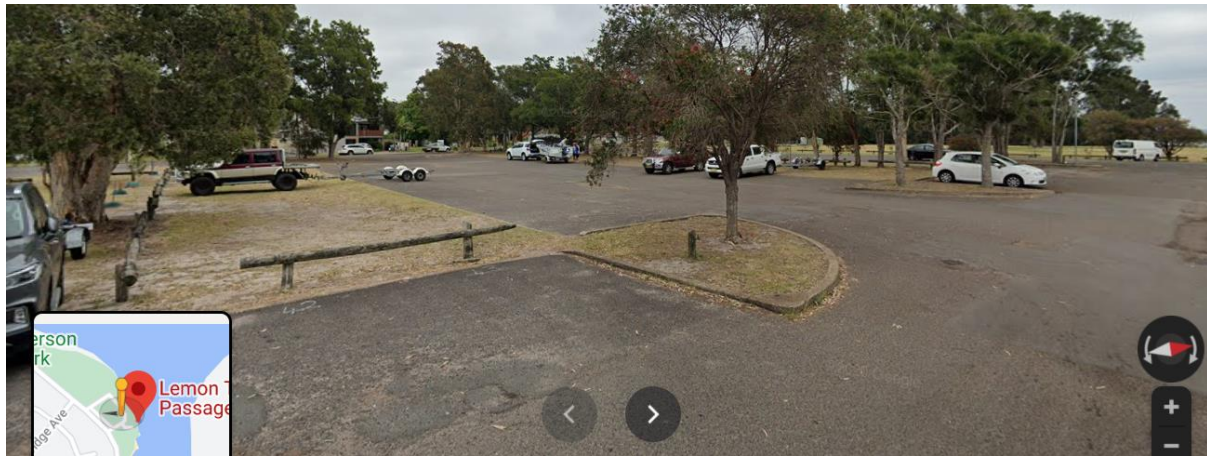
Lemon Tree Passage boat ramp parking.

Ken will be putting Aye-Sea Red in at Lemon Tree Passage Friday afternoon & sailing around to Nelson Bay.