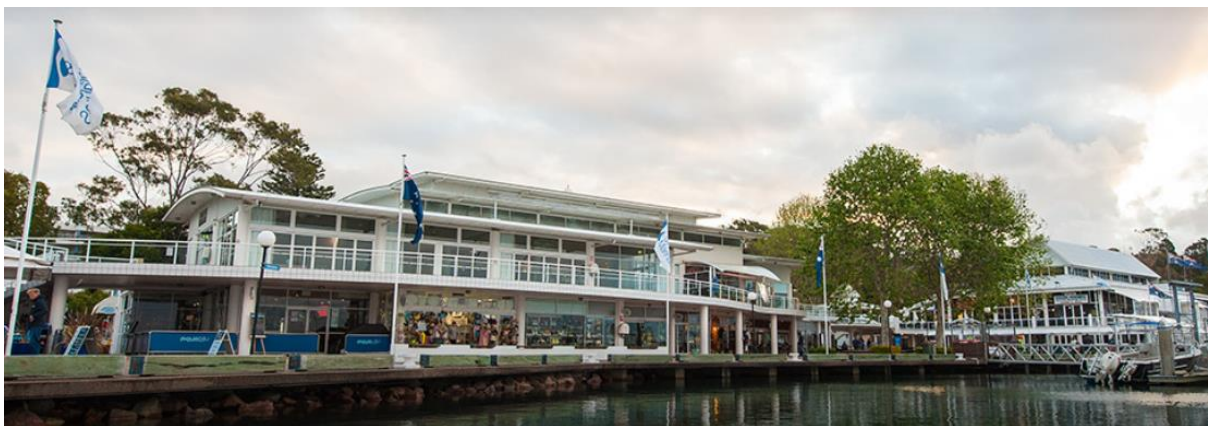
Race office and prizegiving is at Broughtons at the Bay on the 1 st floor in the Marina 1